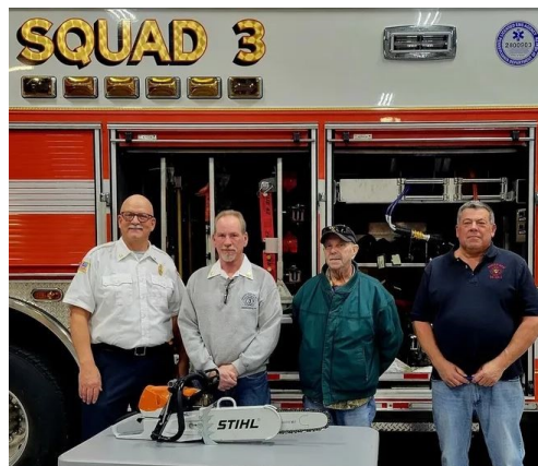
Sons donate a Stihl rescue tool to the Rescue Hose Company

The Rescue Hose Company has a new rescue tool thanks to Sons of The American Legion of Greencastle American Legion [Squadron] 373.