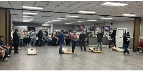
Squadron 274 (Lusby, MD) has a huge turnout for their corn hole tournament