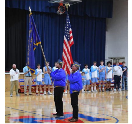
Squadron 95 (Curtis, NE) performing colorguard duties