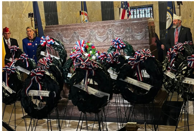
American Legion wreaths placed to honor President Lincoln at his tomb

If you were going to experience something unbelievably memorable, then you should consider going to the Lincoln Pilgrimage in Springfield, Illinois held on Abraham Lincoln's Birthday each year. The Department of Illinois has hosted the Lincoln Pilgrimage for 91 years. It's only two days of activities and remembrance as we gather to honor our 16th President, Abraham Lincoln. Springfield has over fifteen Lincoln-related museums, the tomb of our 16th President, and much more to visit. There is a lot more to do in Springfield than you can't fit it into two days!