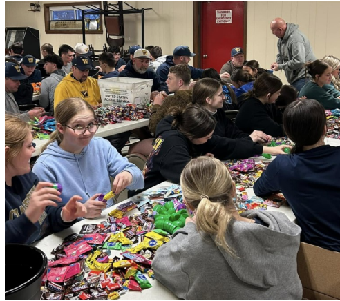
Squadron 371 (Welston, OH) brings together students and coaches from Welston High School to help stuff Easter eggs in preparation for their upcoming annual Easter egg hunt.