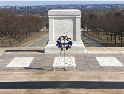
Editor's Photo: SAL Wreath after being placed at the Tomb of the Unknowns

Supporting our veterans is crucial, as they have made significant sacrifices in service to our country. By advocating for the needs and well-being of our