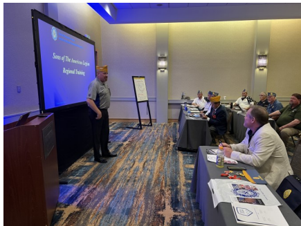
Submitted Photo: Regional Training in Boston

MT&D is creating numerous presentations to develop SAL members moving up through the ranks of the organization as a national standard to supplement the SAL Handbook. These training modules are under review by