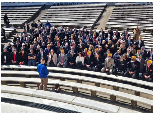
Attendees at the Arlington Wreath Laying are addressed by the Tomb Guards of the US Army 3rd Infantry Regiment, "The Old Guard"