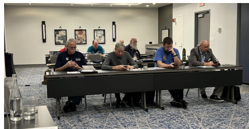
Regional Training in Boston

The American Legion held its second National Regional Information Conference in Boston on Feb.1, where Legionnaires and Sons of The American Legion members received training on the organization's mission, operations and programs. The training was held in conjunction with the Auxiliary's Mission Training at the Hyatt Regency Boston Harbor hotel.