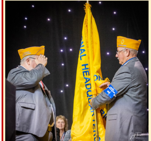
National Convention 2023

One of the functions of the Sergeant-At-Arms is to watch over the membership for flag etiquette. If someone is not rendering honors, the Sergeant-At-Arms should politely instruct the member or guest in the proper procedures. The Sergeant-At-Arms should tell members, guests, and comrades to never to walk or pass between the flags. Always walk around the outside of the flag when going behind the Commanders table.