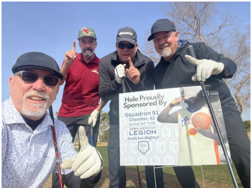
Squadron 91 (Chandler, AZ) supporting Mikey's League by sponsoring a hole in their golf tournament