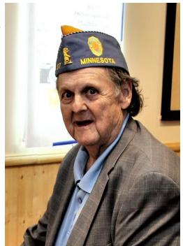
Hodroff-Epstein Memorial Chapel Photo