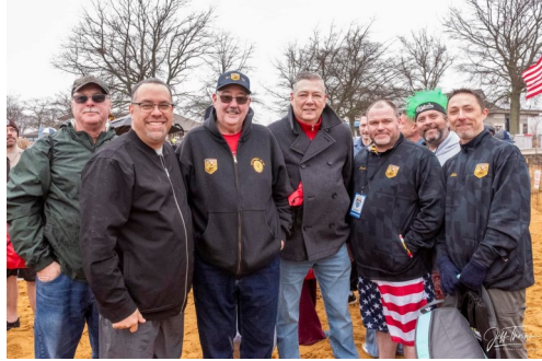
Sons getting ready for the Plunge