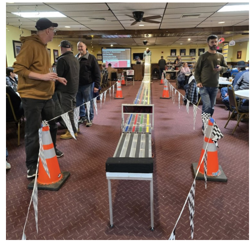
Squadron 414 (Sutton, MA) holds their 3rd Annual Adult Pinewood Derby