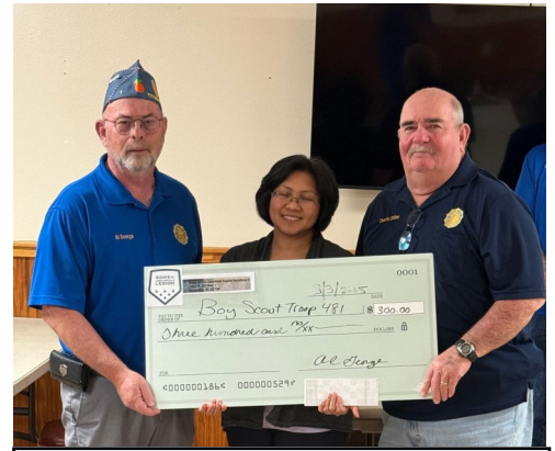
Squadron 1 (Titusville, FL) makes a donation to Boy Scout Troop 481 for their help at the SAL Car Show