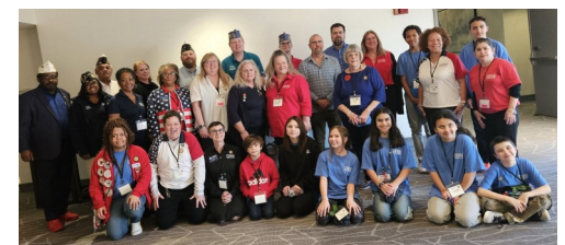
Facebook Photo: NJ Legion Family in Boston

"Every time I listen to the national judge advocate, I pick up more information pertaining to the Constitution and Bylaws interpretation that were not clear prior."