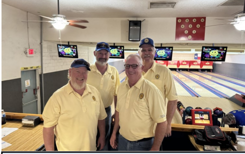
Squadron 208 (Kerrville, TX) held a bowling tournament with I Strike Sports. The Tournament had a great turnout and raised $1,357.50