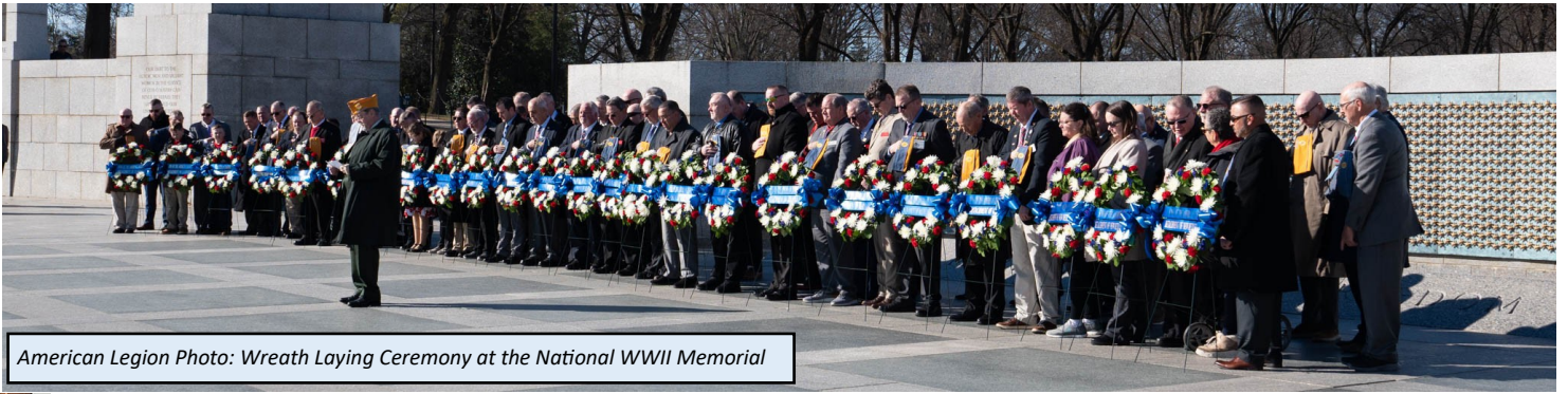
Wreath Laying Ceremony at the National WWII Memorial