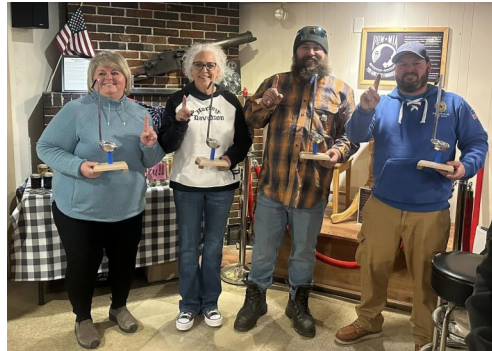
Squadron 86 (Grey, ME) hosts a Chili and Chowder Cookoff with 20 entries and 76 judges.