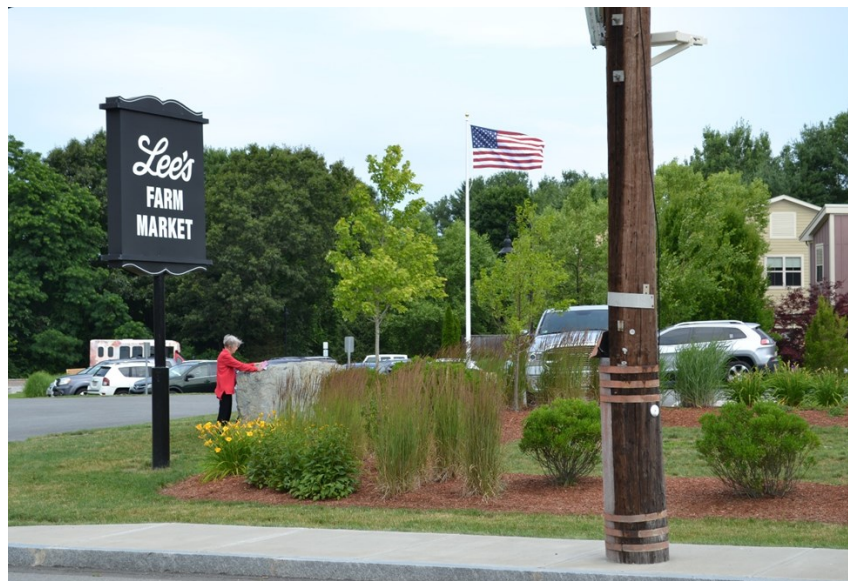
View of the flagpole from Boston Post Road