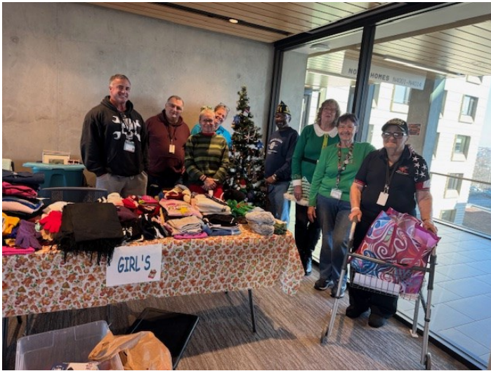
Chelsea Soldiers Home