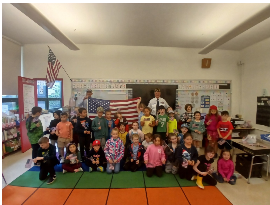
Inaugural "Flags for First Graders", Paxton Elementary School.