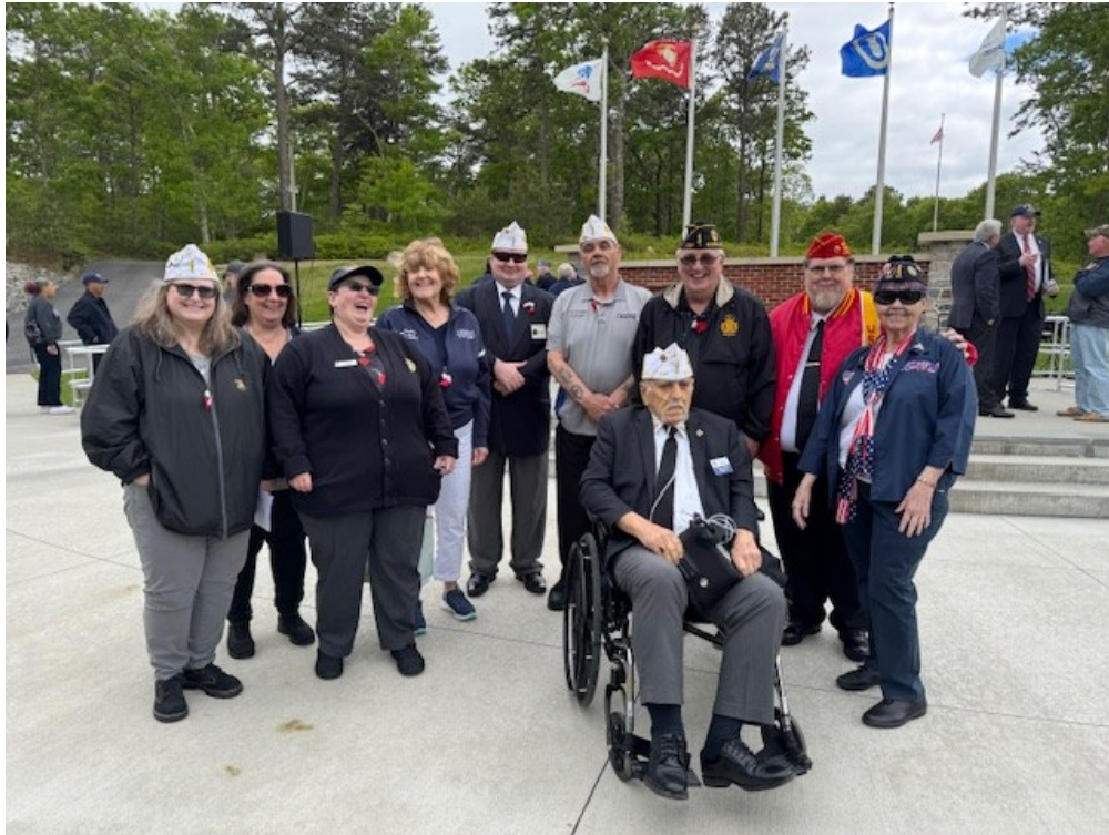
Department of Massachusetts at the Massachusetts National Cemetery for the Memorial Day Ceremony