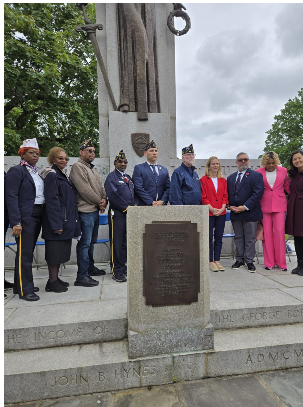
District Seven at Mount Hope Cemetery