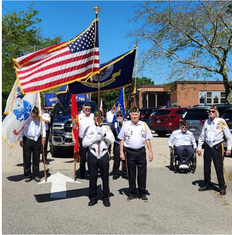
Lining up at the Town Hall.